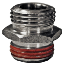
Stock-to-Jagg oil filter nipple

the front face of the adapter using a 5/32" Allen wrench. Then remove the front half of the adapter (the portion with hose fittings attached).