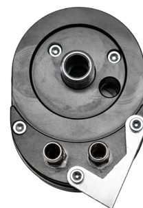
T-C Touring & Dyna fitment