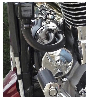
This mounting orientation may be required on some Sportster models