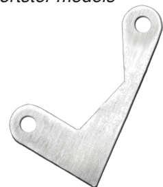
4600AR-C Jagg anti-rotation device