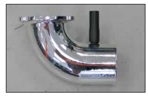
9. Cut the provided crankcase vent hose to a length of 1.75" and install onto the K&N ^{\odot} intake tube as shown.