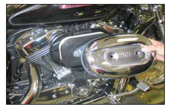
2. Remove the two air filter cover mounting bolts and then remove the cover from the vehicle as

1. Turn off the ignition and disconnect the negative battery cable.