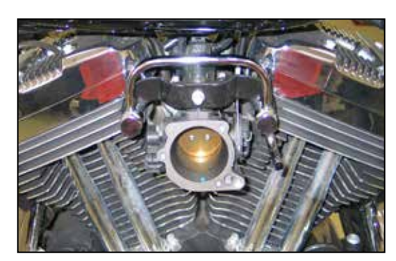
7. Install the K&N<sup>®</sup> crankcase breather tube onto the vehicle using the provided hardware. NOTE: Do not completely tighten the breather bolts at this time.