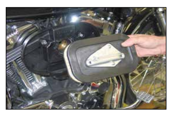
4. Remove the air filter as shown.