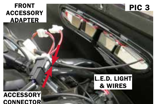
FRONT ACCESSORY ADAPTER